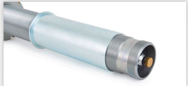
Please note the picture above is of a prototype product which may slightly differ in appearance from the finalized product