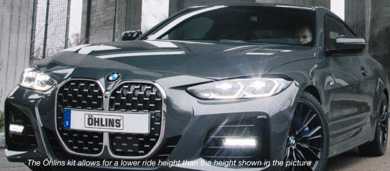
The Öhlins kit allows for a lower ride height than the height shown in the picture